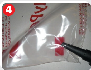
Pump air into pillow until...