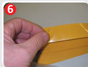
Peel off a clear sticker.