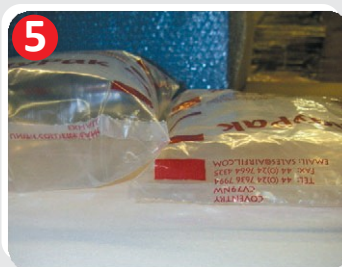
...you achieve the size needed.