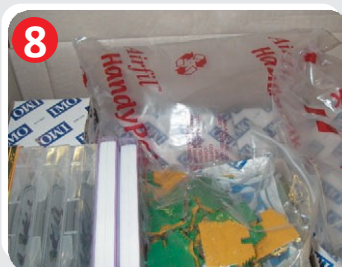
Position pillows as needed to make your good secure.