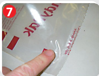
Place sticker over hole and press firmly to stop leaks.