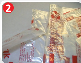
Detach pillow from roll.