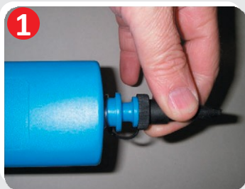
Place nozzle onto pump.