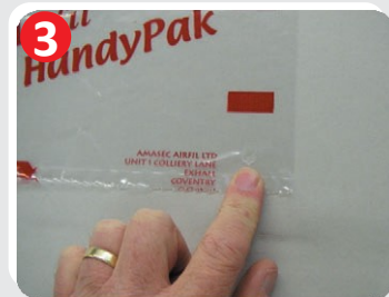
Locate hole in bag.